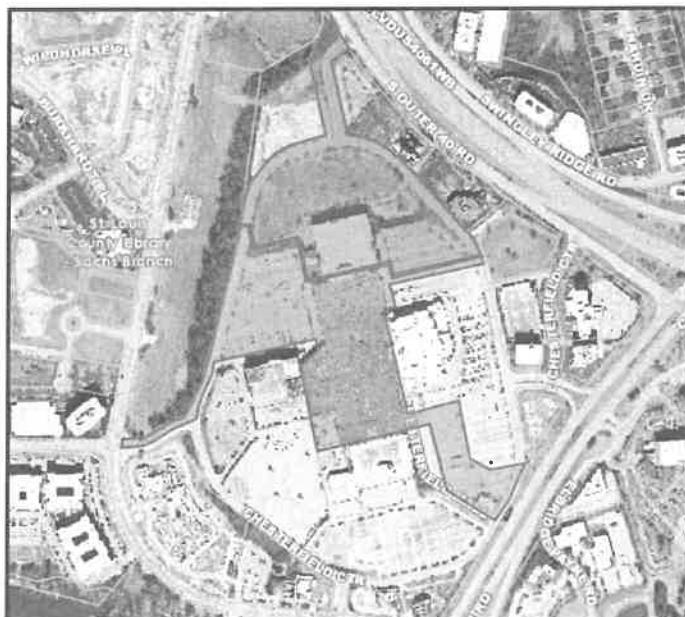
Figure 2: Existing lot configuration

Stock & Associates Consulting Engineers, on behalf of TSG Downtown Chesterfield Redevelopment, LLC and Dillard's Inc., has submitted a Boundary Adjustment Plat for minor modifications to two (2) parcels in the Chesterfield Village subdivision. The first parcel, referred to as Lot C101-C, exists as a 16.679-acre tract of land and would remain 16.679-acres following the adjustment. The second parcel, referred to as new Section B, Lot 101F of the Resubdivision Plat of Lot C101F, exists as a 21.249-acre tract of land and would also remain the same size following the adjustment. The main purpose of this Boundary Adjustment Plat is to facilitate the transfer of land between two property owners. Figure 1 below depicts the existing lot configurations and Figure 2 depicts the portions of land to be swapped which are hatched in their respective color. Staff has reviewed the proposal and has no further comments.