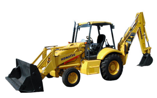
Figure 1: Backhoes (prohibited)