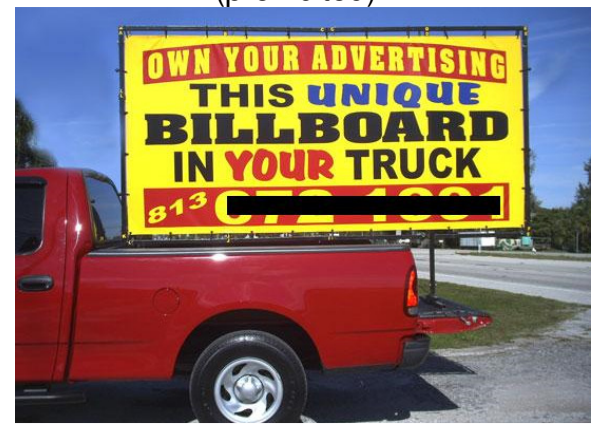
Figure 8: Modified for Advertising (prohibited)