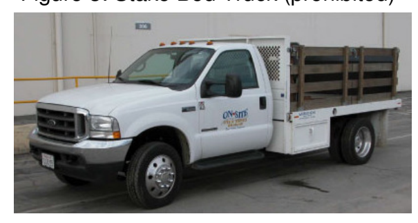
Figure 3: Stake Bed Truck (prohibited)