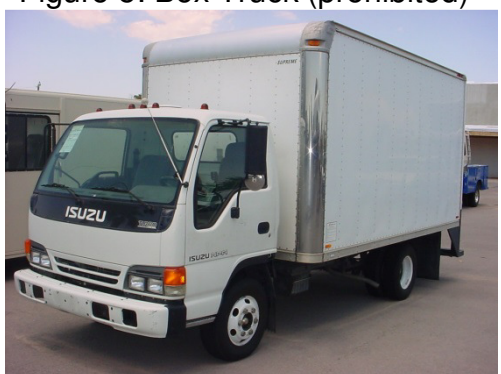
Figure 5: Box Truck (prohibited)