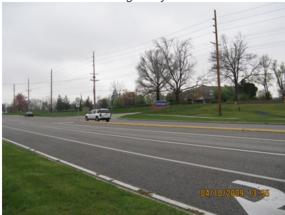
Looking Northwest along Olive Boulevard.