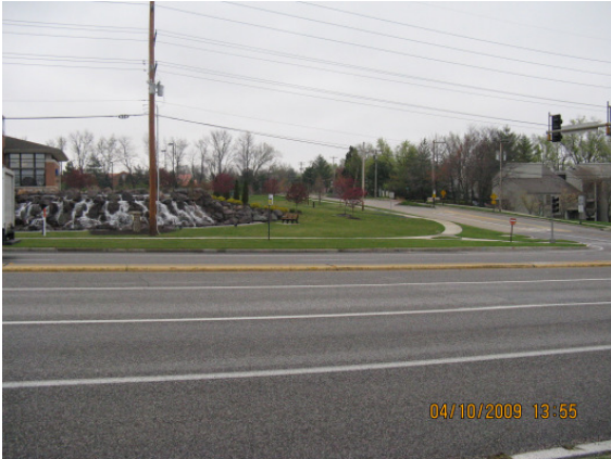
Looking North across Olive Boulevard at Dierberg's Meditation Park and Montgomery National Bank.