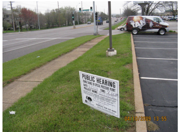
Looking East along Olive Boulevard.