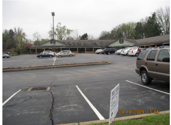
Looking South from Olive Boulevard at the subject site.