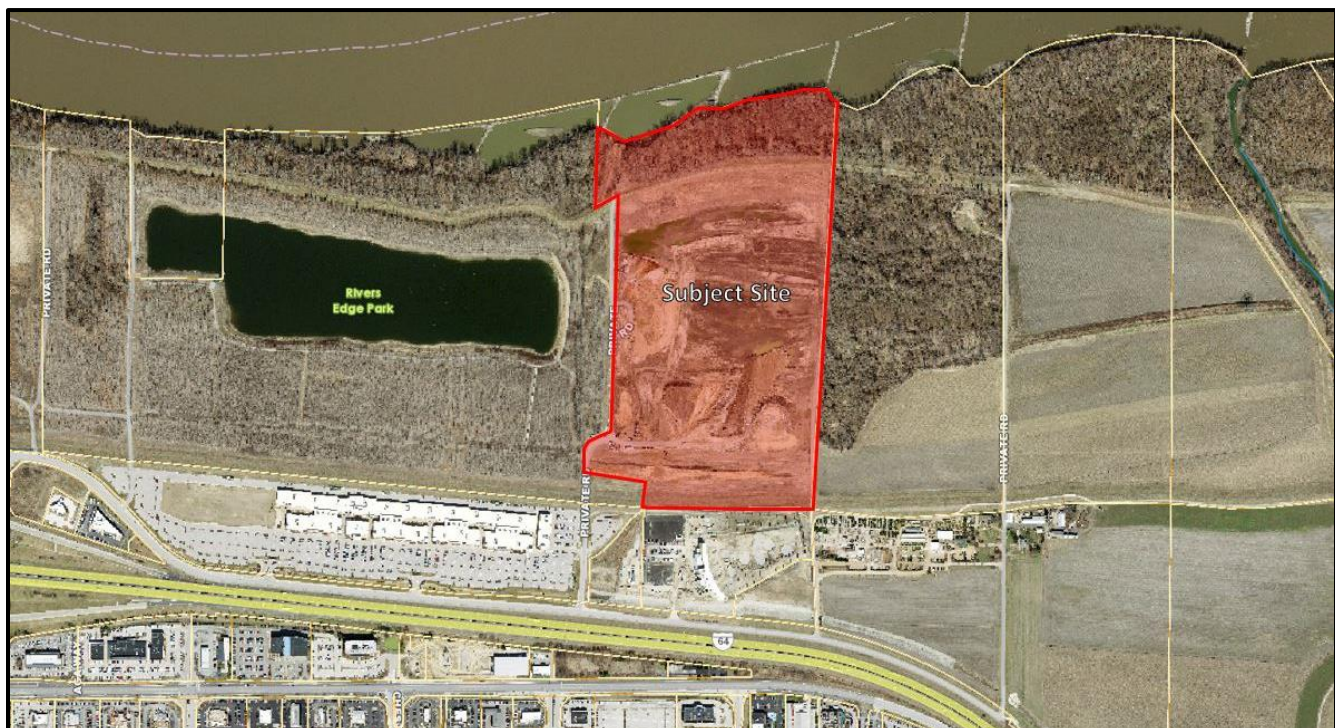
Figure 1: Subject Site Aerial

Attachments: November 13, 2019 Planning Commission Report