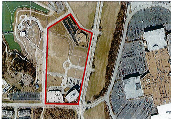
C-8 District Area

This area, shown in the image on the following page, is located adjacent to the City's Central Park and is bordered on the north by Burkhardt Place and on the south by Lydia Hill. This area is comprised of several small parcels totaling approximately 17 acres. While some of these parcels are vacant, others are home to the HOK1 Office Building and parking structure, The Awakening Sculpture, and the Sach's Public Library. This area was zoned "C-8" Planned Commercial District by St. Louis County in 1973 with an amendment to 6.3 acres in 1997 by the City of Chesterfield. This area is currently governed by Ordinances 6815 and 1615.