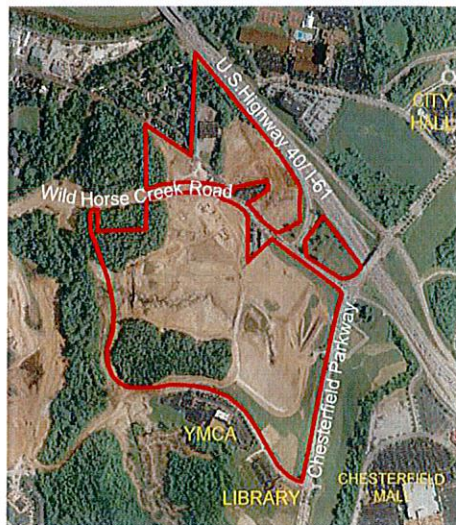
PC&R District Area

The second area, shown below, is located to the north of the previously described C-8 District area and is bordered on the north by Highway 40/61 and on the south by Burkhardt Place. This area was zoned to the Planned Commercial and Residential District (PC&R) in 2008 via Ordinance 2449. This planned district ordinance covers approximately 98.10 acres of land as depicted in the adjacent aerial.