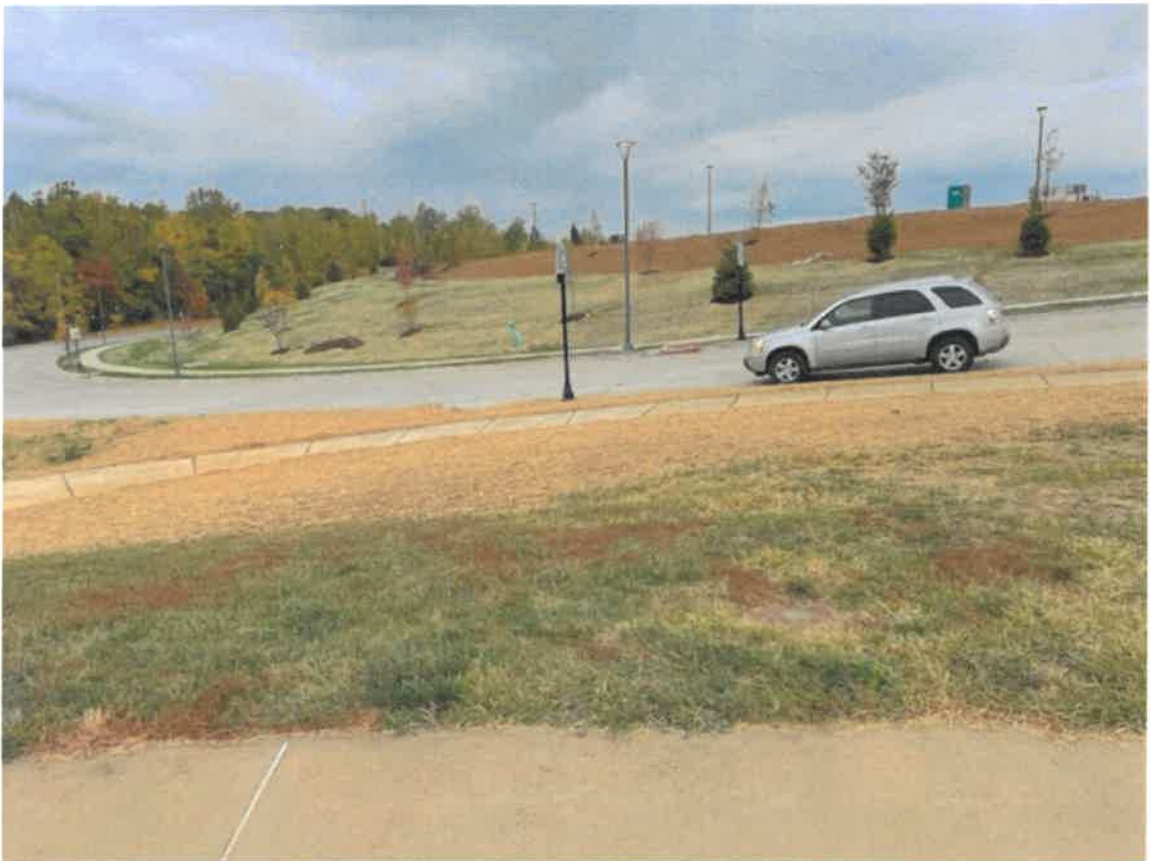
Looking north west from the Lake Two trail