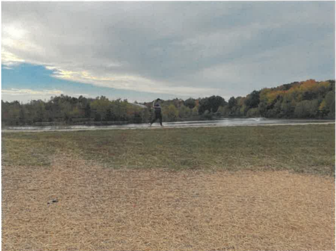
Looking from the Riparian Trail & Burkhart