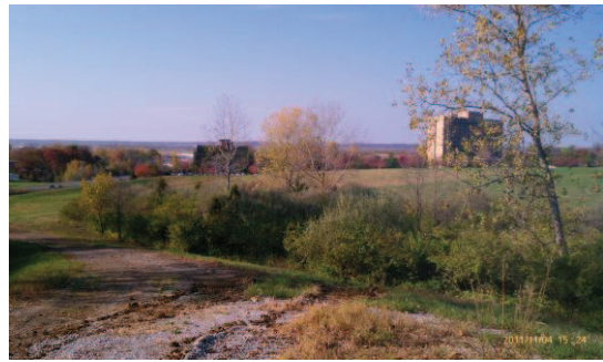
View looking northwest at Site.