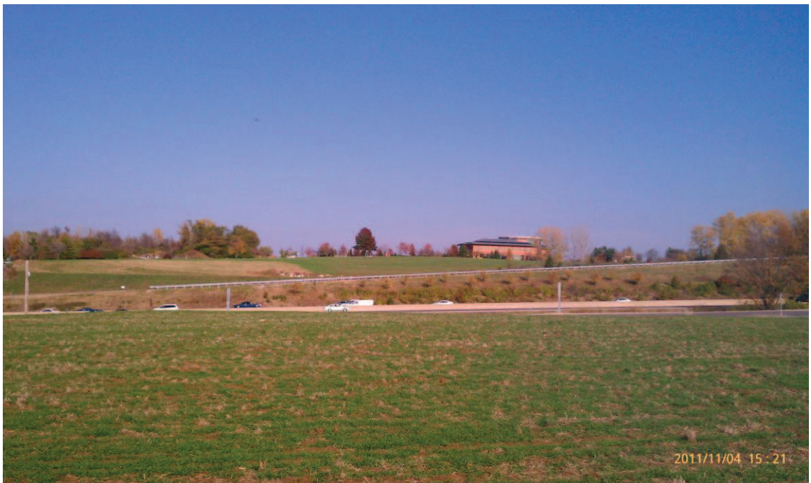
View looking north across U.S. 40/Interstate 64 at Site.