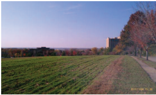
View looking west at Site.