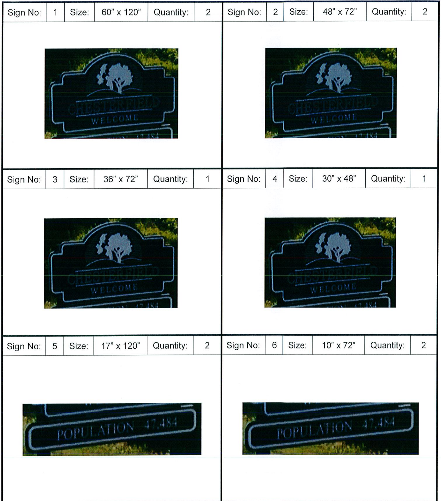
EXHIBIT A Sign Display Detail Attach and Number Additional Sheets if Necessary