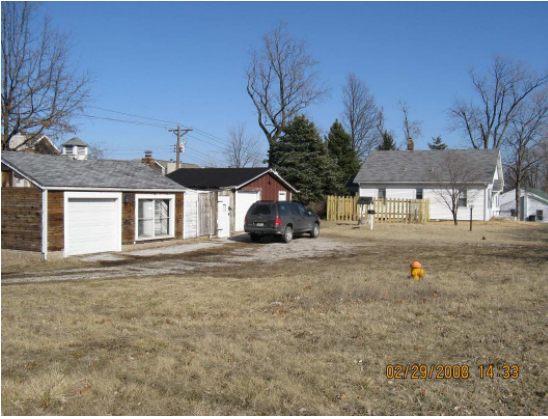
View looking east at the site