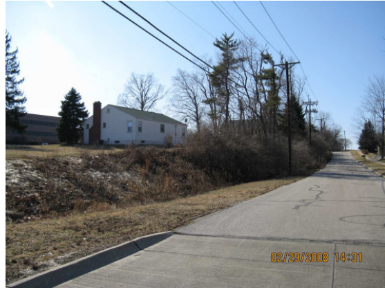
View looking west at the site