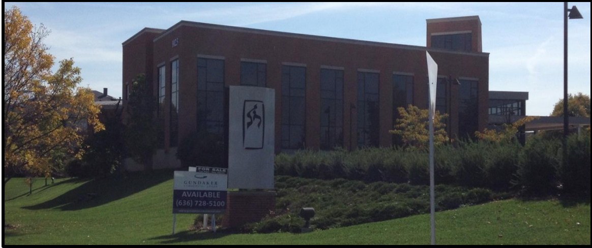
View looking southwest at the site.