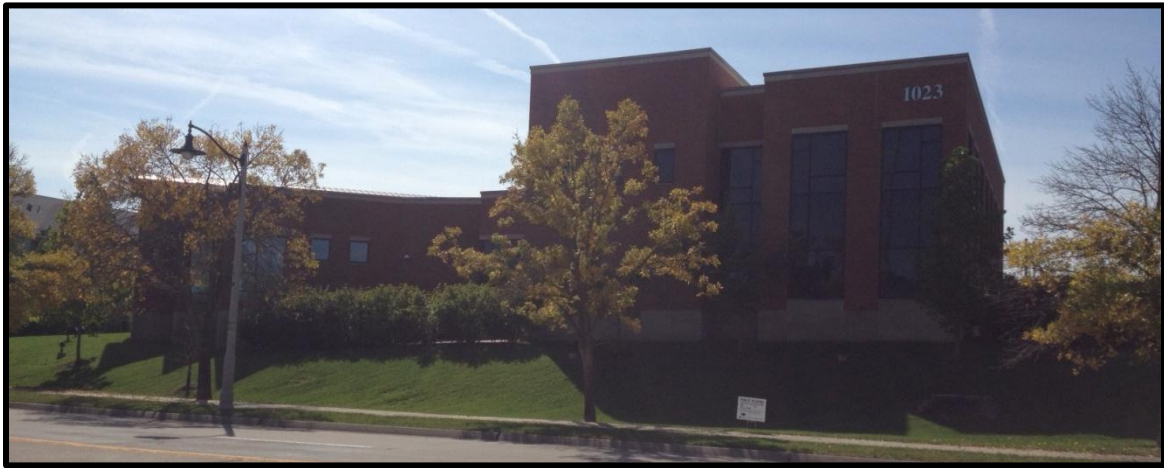
View looking west at the site.