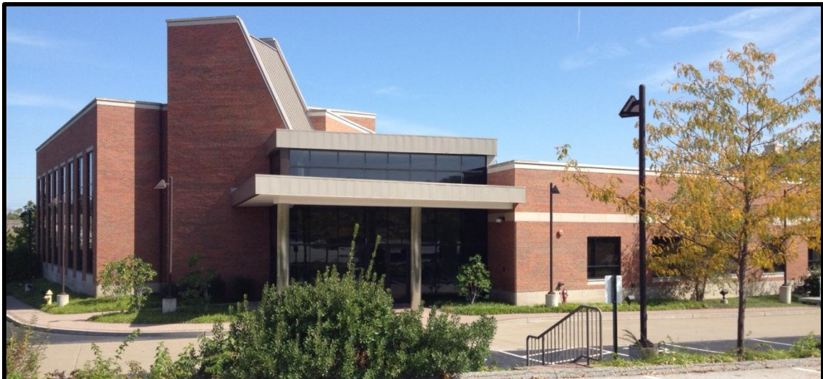
View looking east at the site.