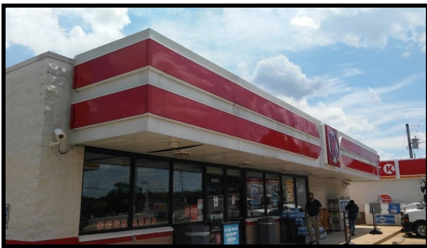
Figure 4: Existing Convenience Store

Currently the banding at the top of the building is individually mounted and internally illuminated. These panels would be removed along with the lighting inside. The lighting under the canopy feature would remain and no new lighting is proposed for the band element.