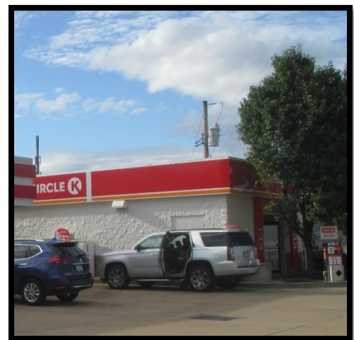
Figure 5: Existing Carwash

The updated fascia on the top of the existing carwash is 4 feet tall and the proposed fascia on the convenience store is 5 feet tall.