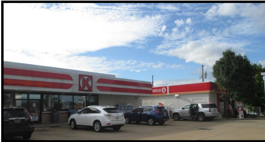
Figure 2: Subject Site with updated Carwash Elevations

The subject site is located between Wildwood Parkway and Baxter Road, southeast of Clayton Road. No changes that affect the circulation system, access, scale, landscaping, screening or lighting are proposed for the site.