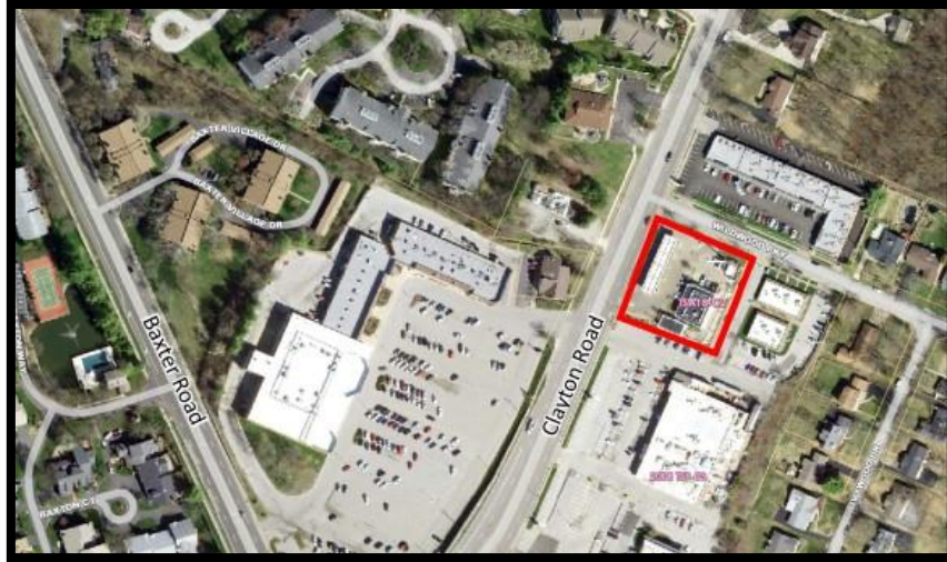
Figure 1: Aerial of Subject Site

Plan, Architectural Elevations, Landscape Plan and Lighting Plan were approved by the Planning Commission in April 2006. Then in August 2007, Amended Architectural Elevations for a change to the elevation of the carwash were approved by the Planning Commission with a vote of 8-0. In 2009, Second Amended Architectural Elevations were approved by City Council. In June 2018, changes to the carwash were approved by the Planning Commission.