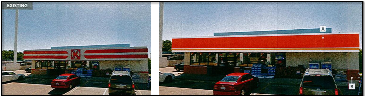
Figure 3: Existing and Proposed Convenience Store

The proposed color palette for the building includes removing the painted red brick band approximately 30" from the ground and repainting the area to Nuthatch brown. Additionally, they are proposing to utilize ACM fascia bands for the banding at the top of the building, in a similar pattern to the carwash building. The ACM bands come in standard sizes with the colors screened printed on top. This band is fashioned between two pieces of aluminum to mount to the building to create one solid plane. In response to discussion regarding the scale of the banding, the Applicant has indicated the colors could not be evenly split to balance the white space that would remain if the width of the red band is reduced due to the manufacturing and installation processes.