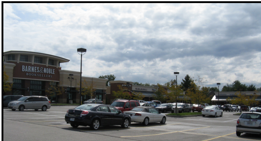
View looking south at the site.