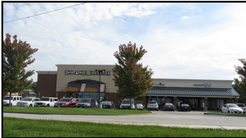
View looking east at the site.