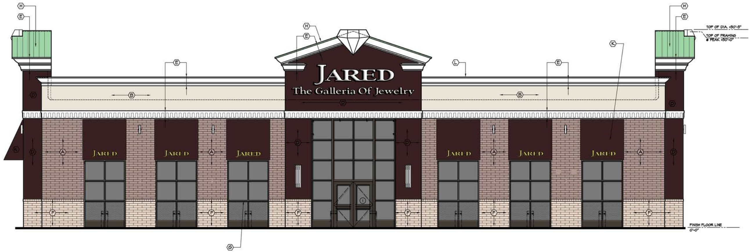
A EAST (FRONT) ELEVATION A2 SCALE: 1/4"=1'-0"