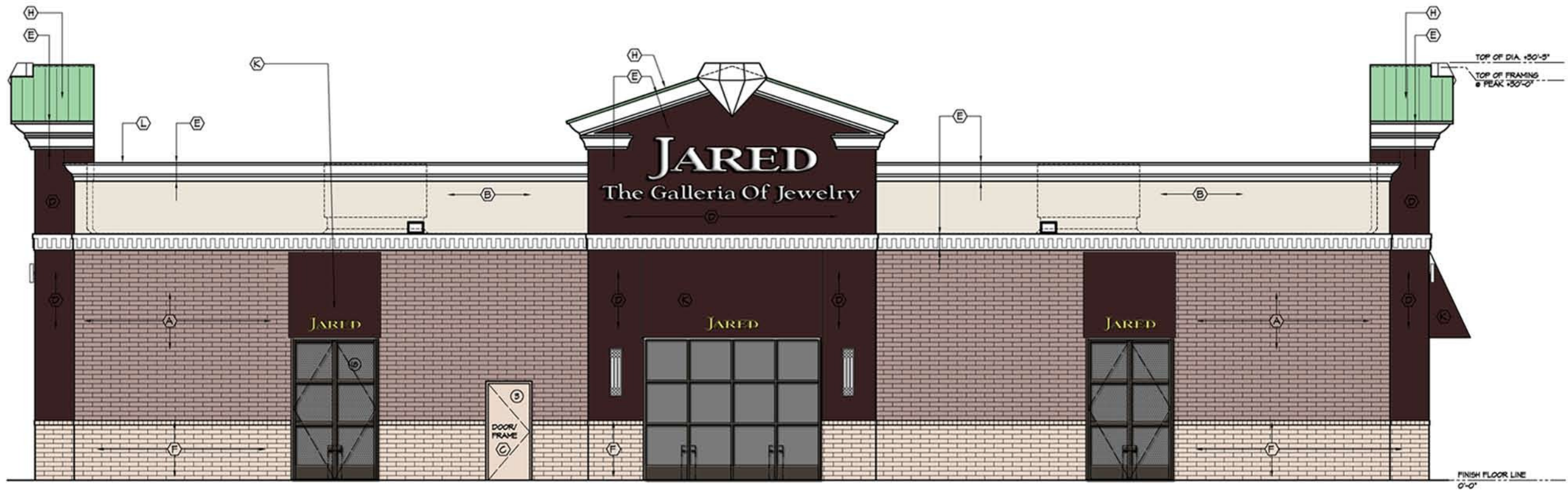
C WEST (REAR) ELEVATION A3 SCALE: 1/4"=1'-0"