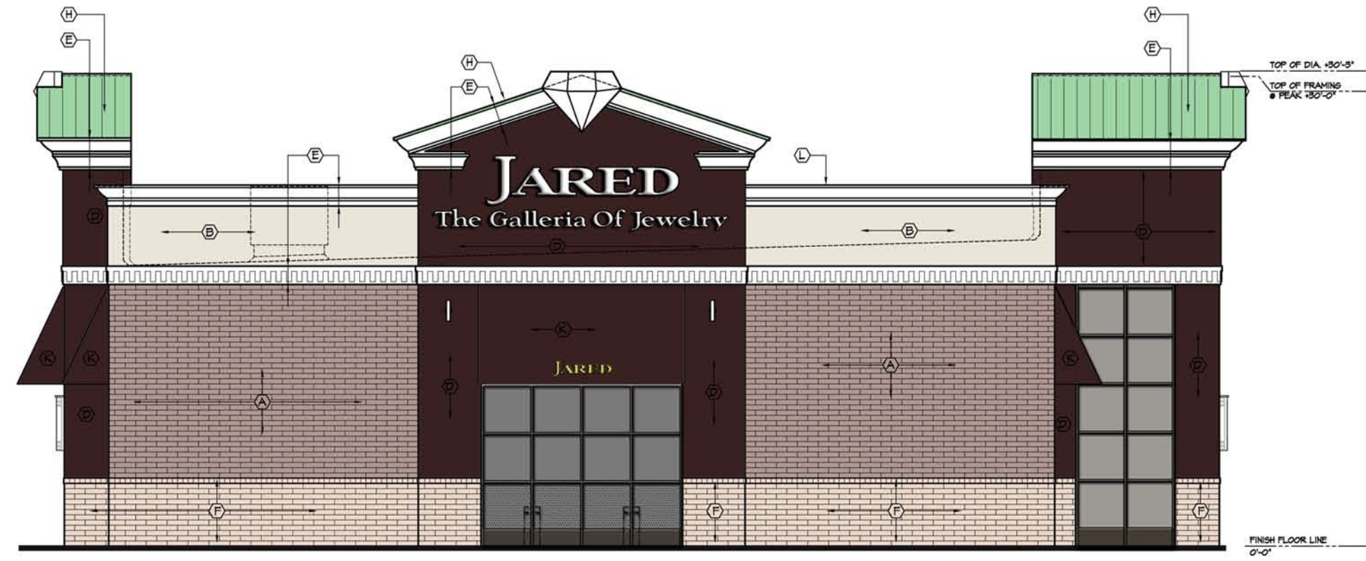
B SOUTH (LEFT) ELEVATION A2 SCALE: 1/4"=1'-0"