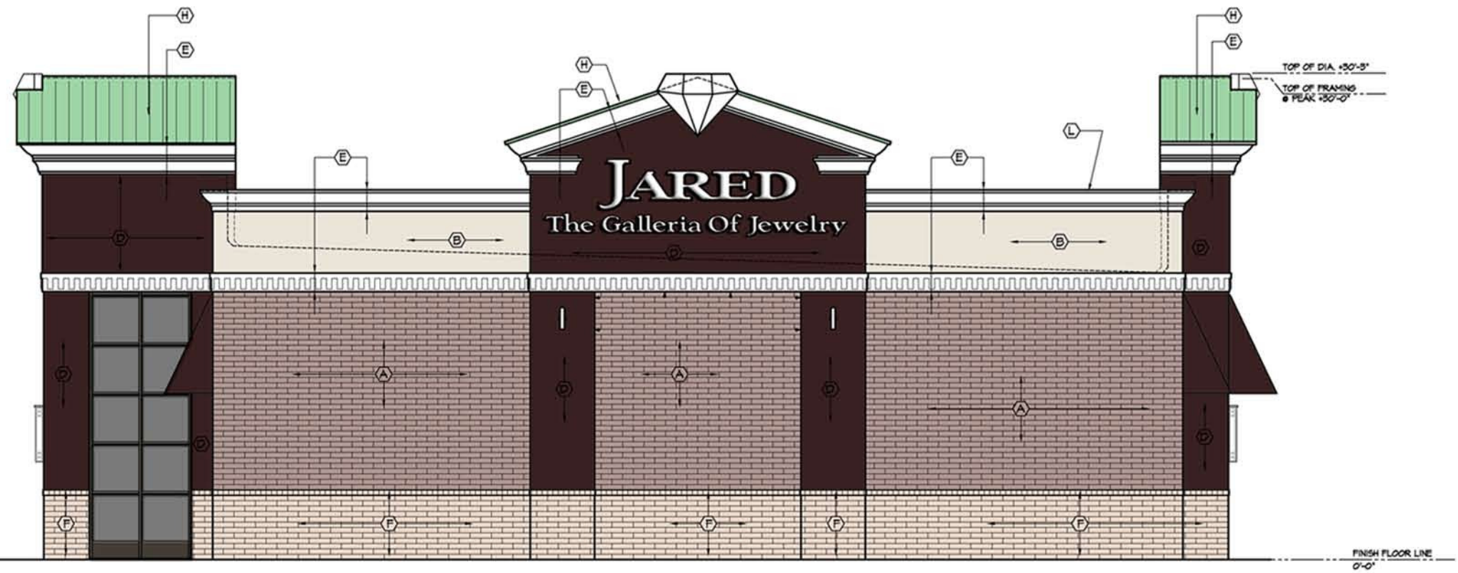
D NORTH (RIGHT) ELEVATION A3 SCALE: 1/4"=1'-0"