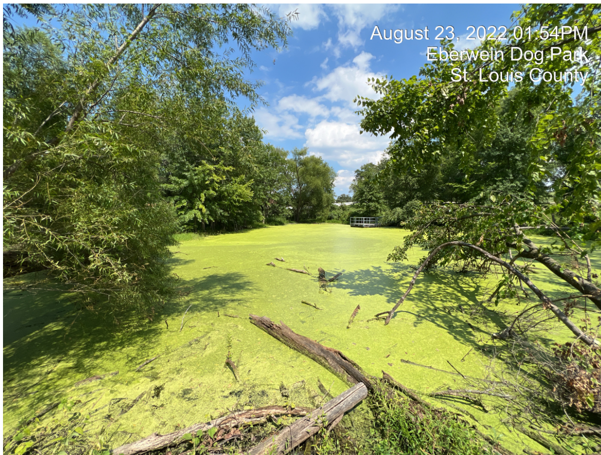
Photo taken from bottom of dam looking east at leak.

August 23, 2022 01:54PM Eberwein Dog Park St. Louis County