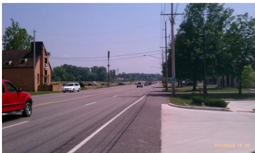
View looking S down Long Rd.