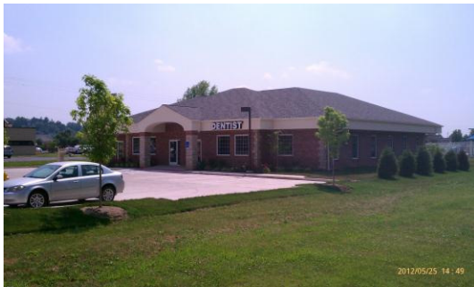
View looking SW at Site.