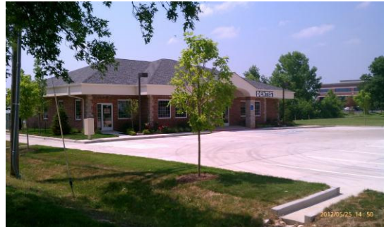
View looking NW at Site.