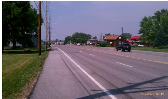
View looking N up Long Rd.