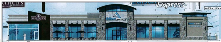
Figure 4: West Elevation—Approved wall signage