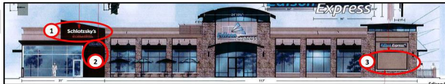
Figure 5: West Elevation—REVISED Requested wall signage (May 2019)