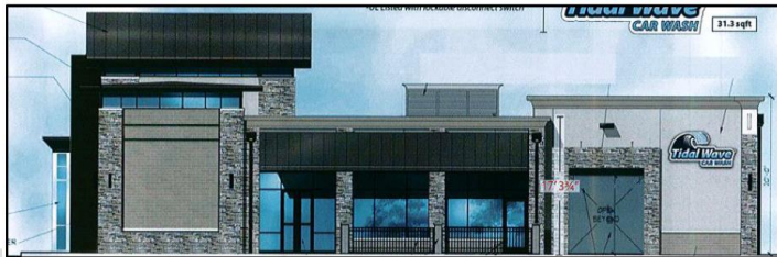
Figure 8: South Elevation—Approved wall signage