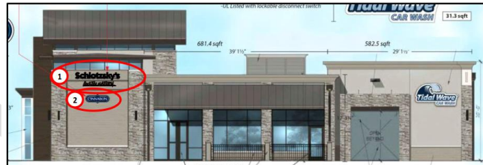
Figure 9: South Elevation—REVISED Requested wall signage (May 2019)