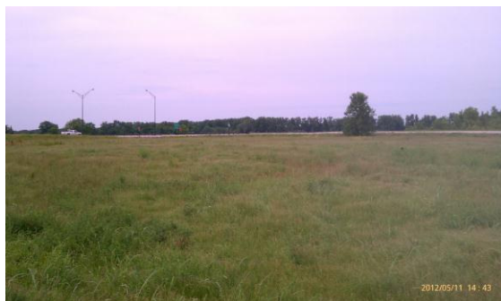
View looking NW at Site.