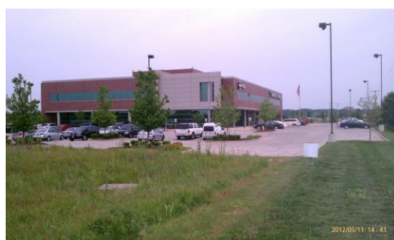
View looking NE at Site.