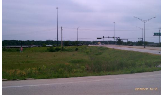
View looking SW at site.