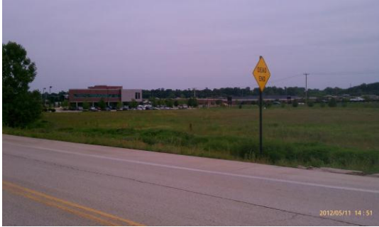
View looking SE at site.