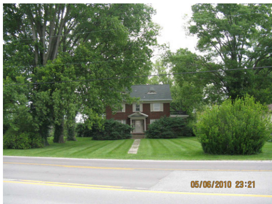
View of Brasher Property