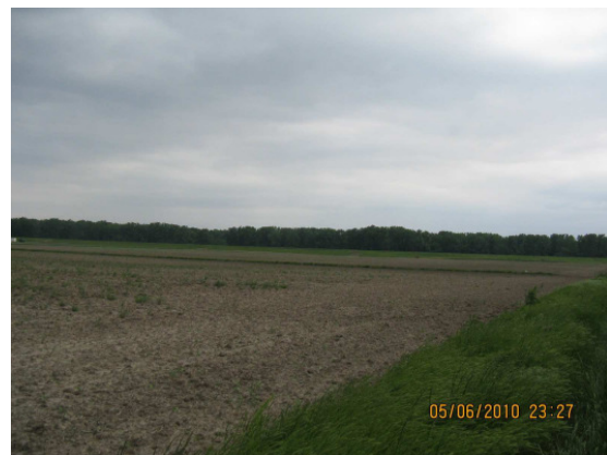
View North from rear of Brasher Property