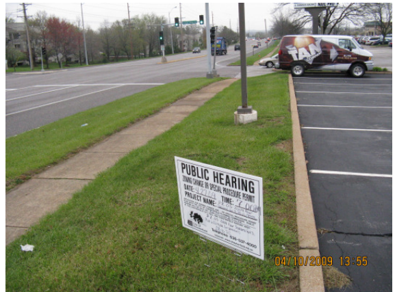
Looking East along Olive Boulevard.