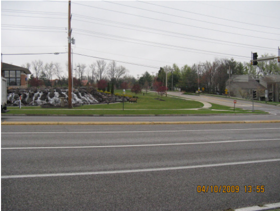
Looking North across Olive Boulevard at Dierberg's Meditation Park and Montgomery National Bank.