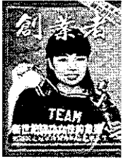
Yue Ling Chen: On the Road to Olympic Gold!

Yue Ling Chen is a young woman of firsts. The first gold medalist in a women's Olympic walking event--and the first Asian woman and the first Chinese athlete, man or woman, to ever win an Olympic track and field event.