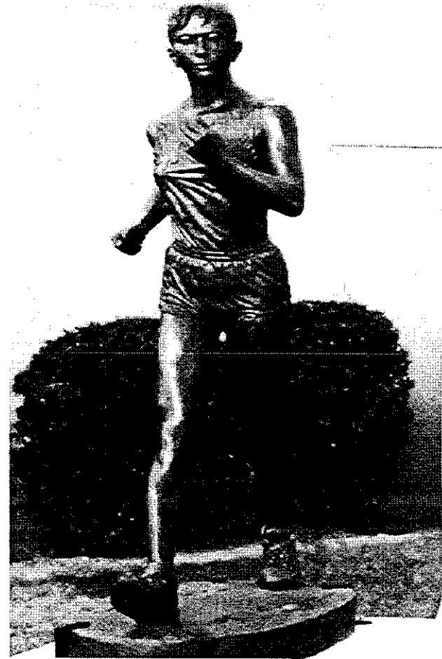
Yue Ling Chen Life Size Bronze 5' $80,000