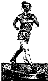
Small Bronze Limited Edition SN by Artist & Athlete 13"x 8"x3" $10,000