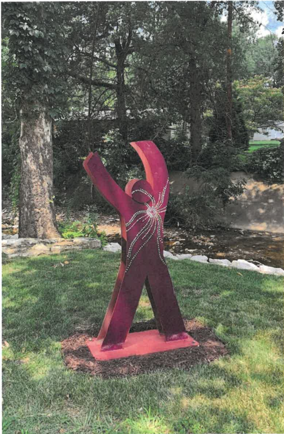
Joy stands 5'3" tall