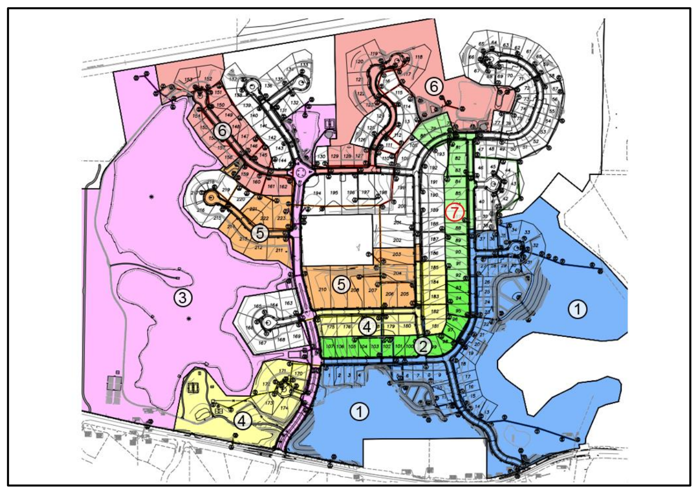
Figure 2: Plats and Associated Improvements

Below in Figure 2 is an image that outlines all the six plats included in Phase 1 along with the additional Plat 7 with the associated improvements for each plat. Table 1 below Figure 2 identifies each plat, provides the number of lots contained in each plat, followed by a brief description of that plat.