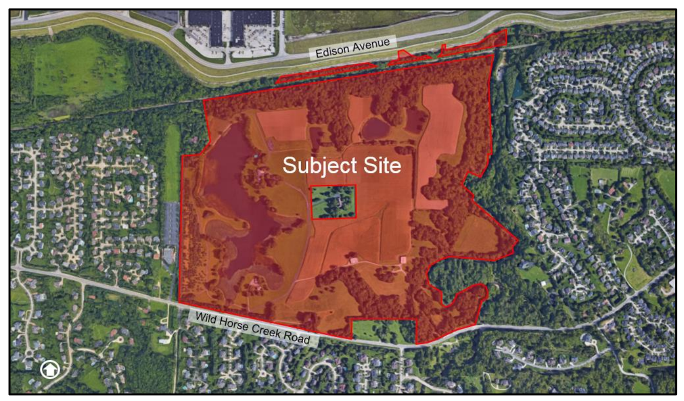
Figure 1: Subject Site Aerial

On July 31, 2018, the City of Chesterfield approved the Improvement Plans for the development. The grading permit remains valid until the expiration of June 6, 2023. If work on this project will continue beyond that date, a permit extension request may be submitted.