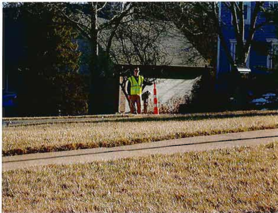
Photo 2 – Penshurst Place southbound looking east on West Manor Drive

Photo 2 is taken from an intersection approach distance of 70 feet, heading south on Penshurst Place looking east on West Manor Drive.