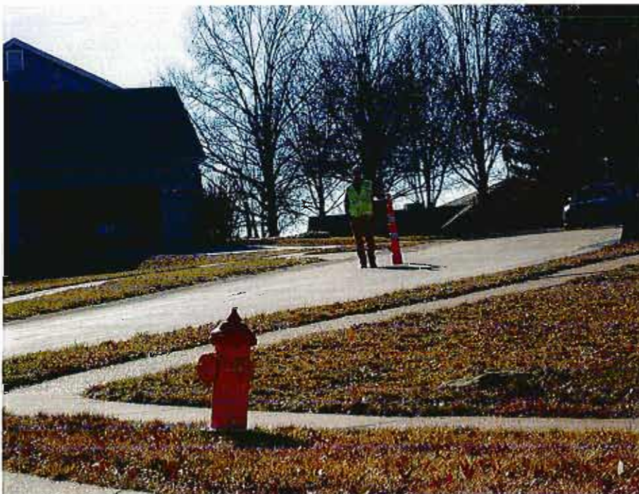
Photo 3 – Penshurst Place southbound looking west on West Manor Drive

The traffic cone is 60 feet from the intersection. This intersection sight distance meets 10 mph criteria for acceptable uncontrolled intersection conditions.