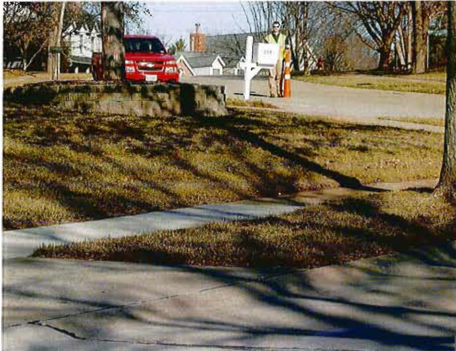
Photo 2 – Penshurst Place eastbound looking north on West Manor Drive

Photo 2 is taken from an intersection approach distance of 70 feet heading east on Penshurst Place looking north on West Manor Drive.