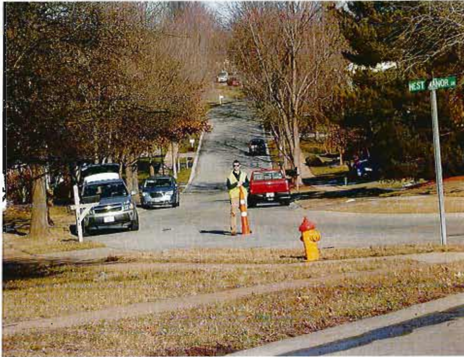
Photo 4 –West Manor Drive eastbound looking north on Penshurst Place

Photo 4 is taken from an intersection approach distance of 60 feet, heading east on West Manor Drive looking north on Penshurst Place.