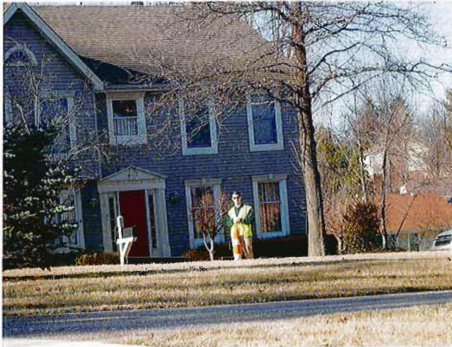
Photo 5 –West Manor Drive westbound looking north on Penshurst Place

The traffic cone is 70 feet from the intersection. This intersection sight distance meets 10 mph criteria for acceptable uncontrolled intersection conditions.