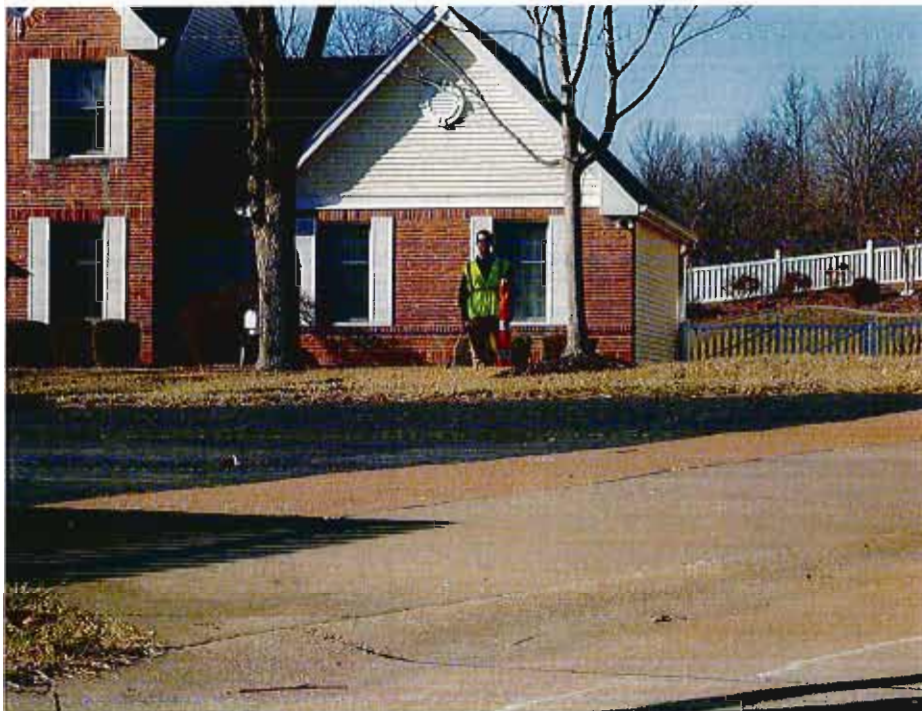
Photo 5 – West Manor Drive northbound looking west on Penshurst Place

The traffic cone is 70 feet from the intersection. This sight distance meets the 10 mph criteria for acceptable uncontrolled intersection conditions.