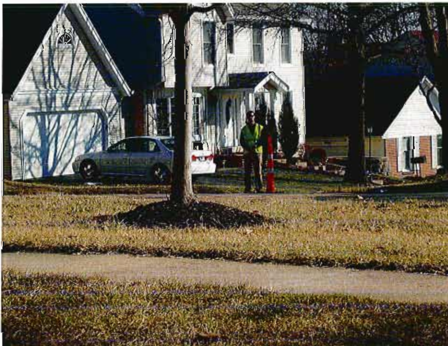
Photo 3 – Penshurst Place eastbound looking south on West Manor Drive

The traffic cone is 60 feet from the intersection. This intersection sight distance meets the 10 mph criteria for acceptable uncontrolled intersection conditions.