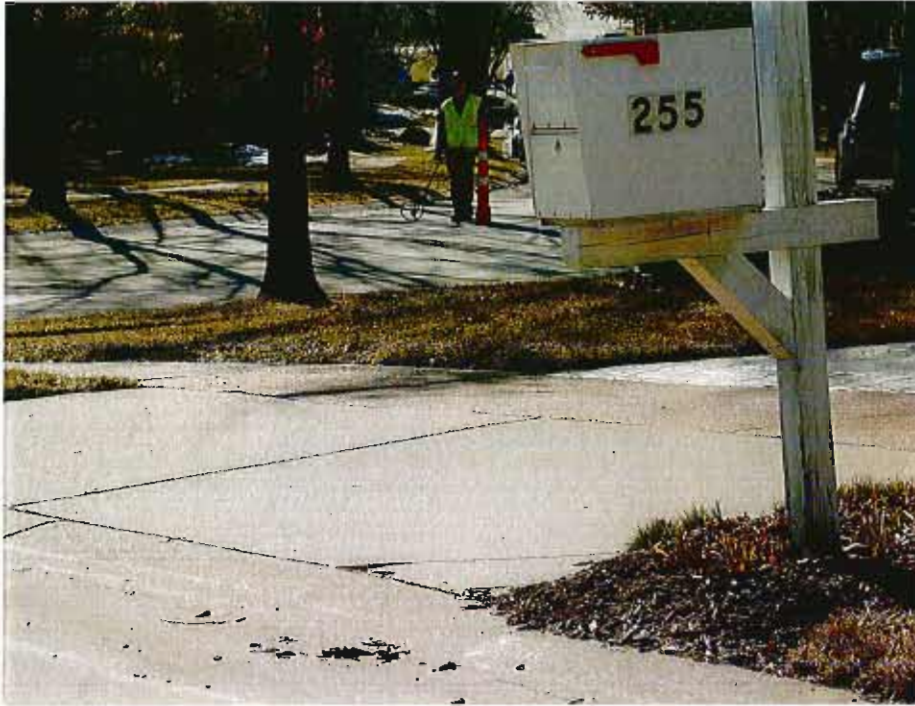
Photo 4 – West Manor Drive southbound looking west on Penshurst Place

Photo 4 is taken from an intersection approach distance of 60 feet heading south on West Manor Drive looking west on Penshurst Place.