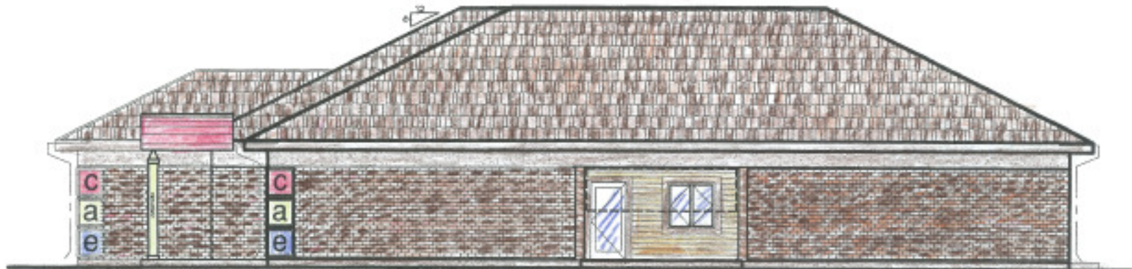
4 SOUTH ELEVATION SCALE: 3/32" = 1'-0"

KILLIAN SMITH ARCHITECT + ASSOCIATES, P.C. 18. Lisle, MD 20712 Fax 314.404.8888