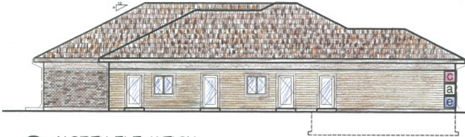
1 NORTH ELEVATION SCALE: 3/32" = 1'-0"