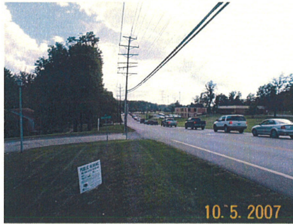
Looking south along Woods Mill Rd.