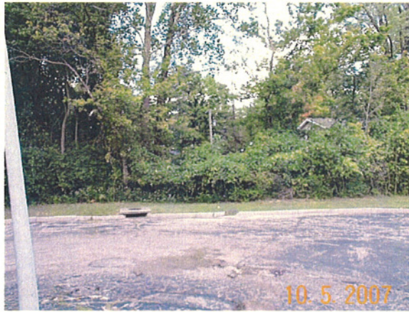
Looking north from the Subject Site