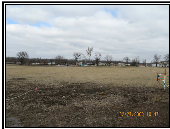
View looking north from subject site.