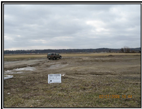
View looking south across subject site.