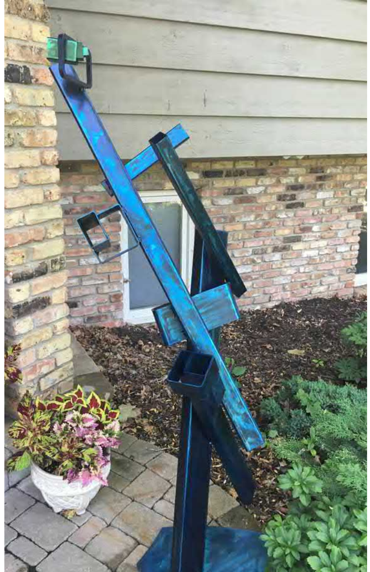
Artist: Craig Snyder Title of Work: Green-Eyed Seeker Dimensions: 6' x 3' x 3' Material: Patinaed Steel Description: Geometric industrial components pop with blue. But can it be Green? Is it envious of the all the blue or will it rise above? The second piece in my Green-Eyed series, inspired by Green Eyed Lady, sung by Sugarloaf. Maintenance: None Price/Insurance Value: $5200