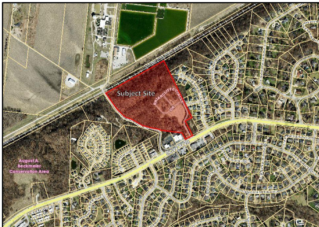
Figure 1: Subject Site Aerial

Stock & Associates Consulting Engineers, Inc., has submitted a request for a zoning map amendment from the “R-3” Residence District with a “PEU” Planned Environmental Unit to the “R-3” Residence District. The petitioner is requesting to repeal the “PEU” as part of a two-step zoning process. The second step in this process is an additional petition for a zoning map amendment to obtain “PUD” Planned Unit Development zoning (P.Z. 20-2019).