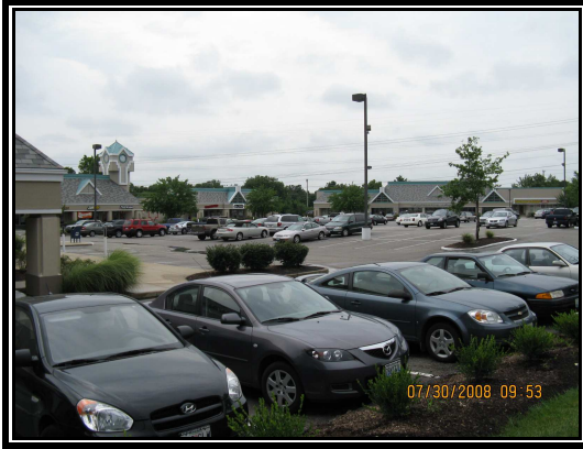
Looking southeast at the subject site from Clarkson Road