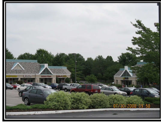
Looking northeast at the subject site from Clarkson Road.