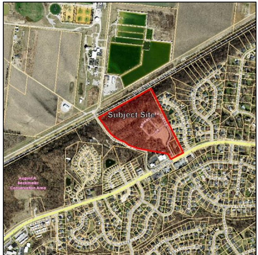
Figure 1: Subject Site Aerial

In 2013, a request to amend the governing ordinance for the subject site was submitted, and in 2014, two requests for zoning map amendments were submitted. However, these applications were withdrawn by the applicant with no further action taken.