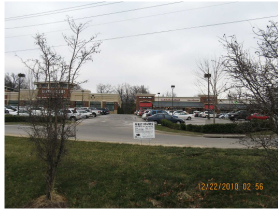
View looking east at the site.