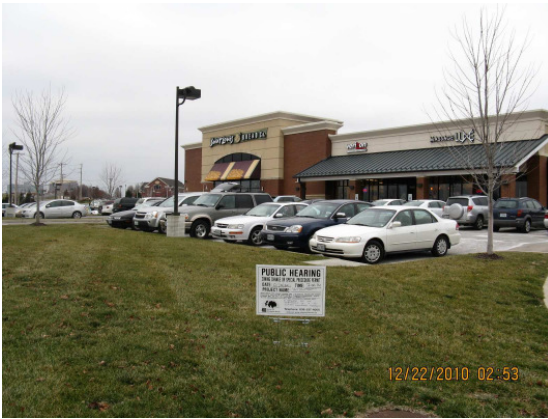
View looking north at the site.