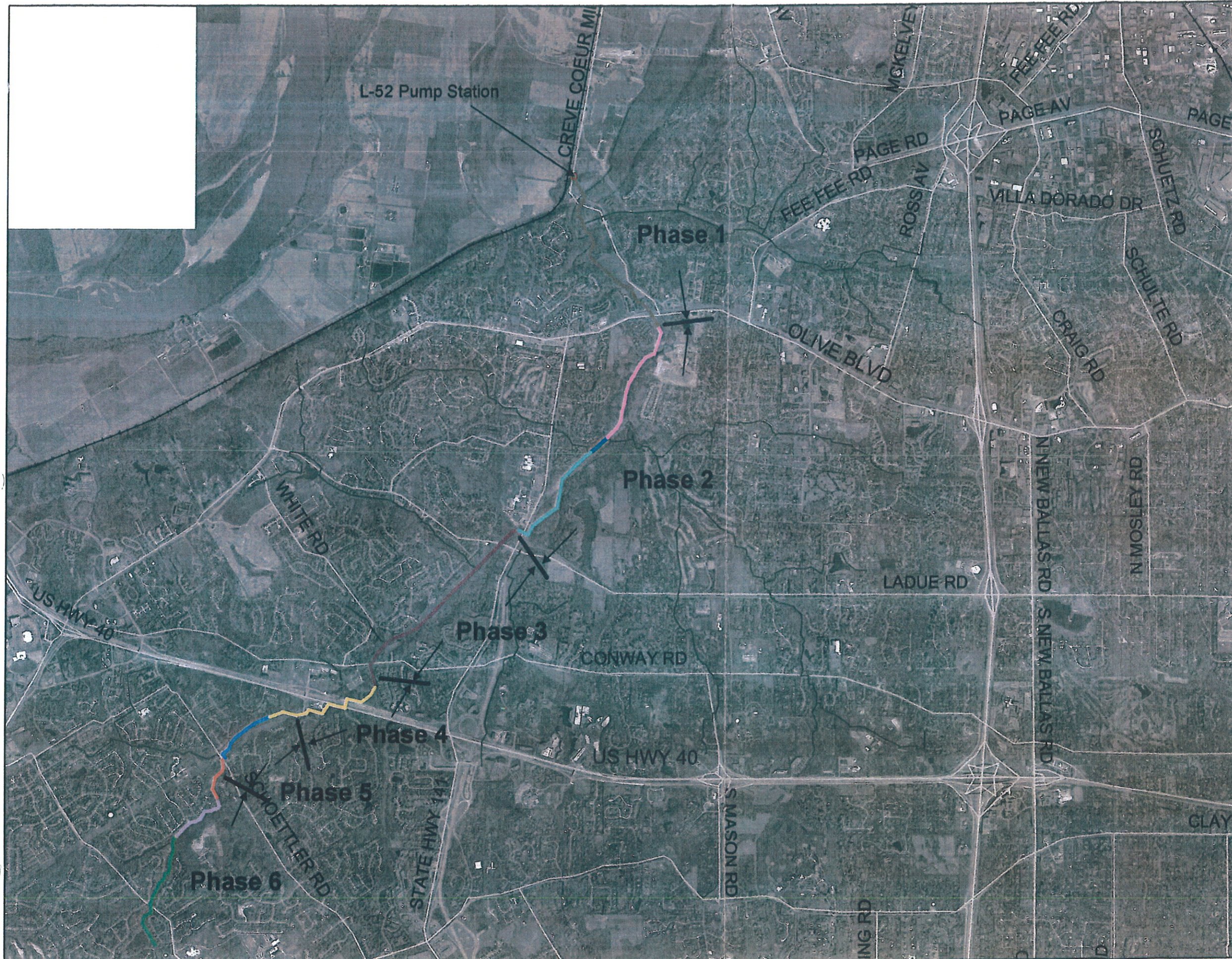
Figure 1-7 Trunk Sewer Construction Phasing