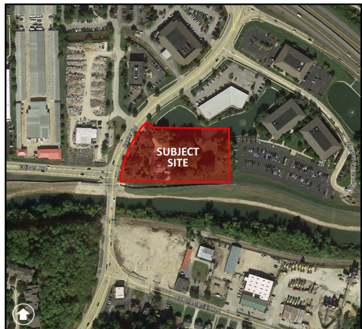
Figure 1: Subject Site Aerial

A Public Hearing was held on November 25, 2019, at which time there were no issues raised by the Planning Commission.