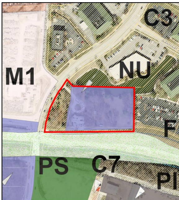
Figure 2: Zoning Map