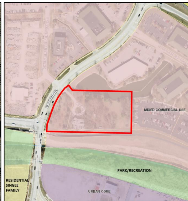
Figure 3: Future Land Use Map