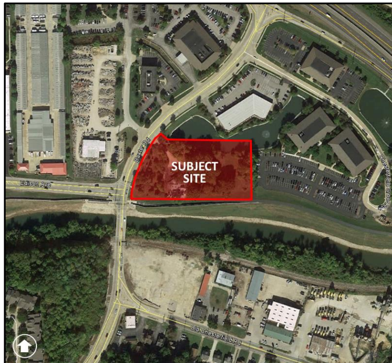
Figure 1: Subject Site Aerial